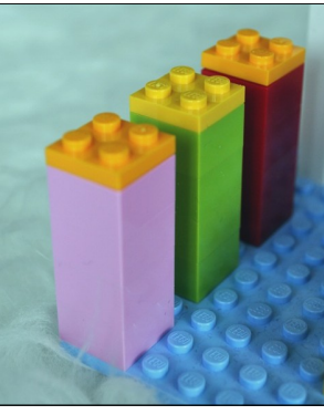
This Lego Nativity was built by the daughter of an American Pastor. He liked it.

"Traditional Nativities seem too good to be true. The manger was messy, people are messy, life is messy and my God came down to all the mess, not some sanitized version of us. Somehow the Lego version appeals to me. It suggests the characters—like the three Kings with their little crowns—. but leaves it open for me to fill in the rest."